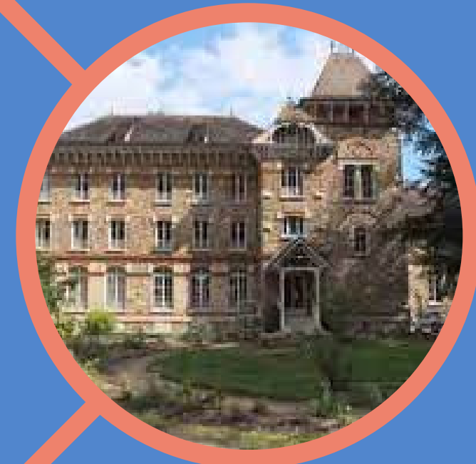
Saint Germain en Laye