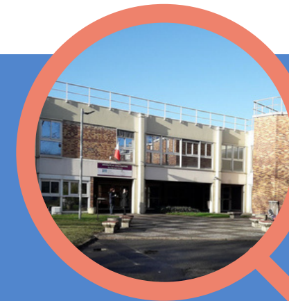
Cergy - Hirsh

Depending on selected unit courses, 4 locations are part of the INSPÉ, but our Erasmus students will most likely attend courses in: Saint Germain en Laye Cergy - Hirsh Gennevilliers